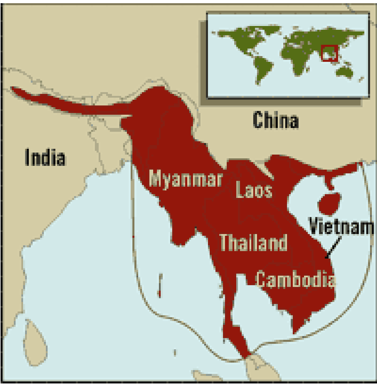
Dipterocarpus costatus C.F. Gaertn.