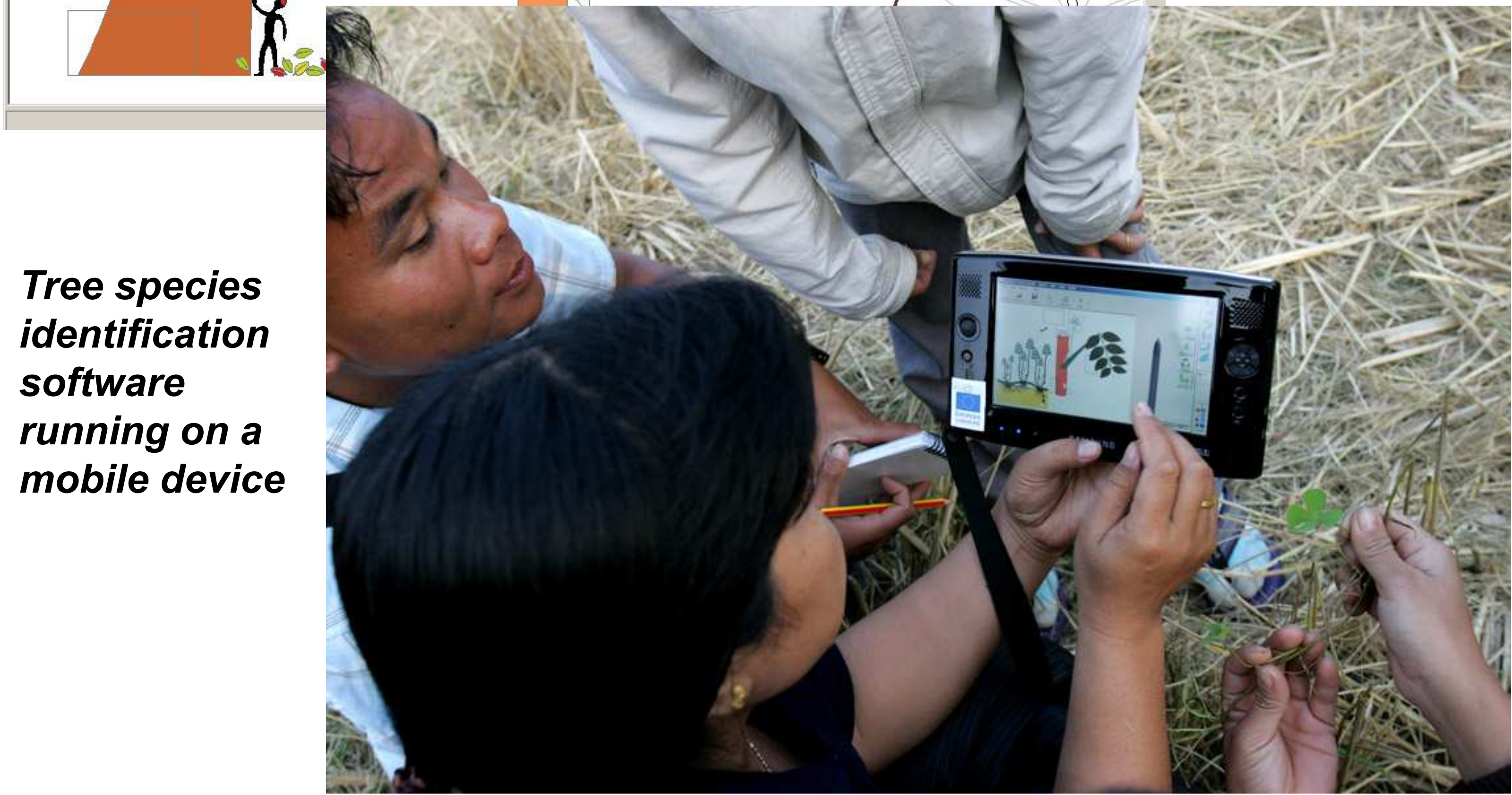
Tree species identification software running on a mobile device